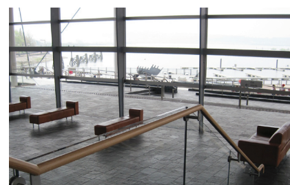
ABOVE: Internal Glass Balustrades

Situated at Cardiff Bay in Wales, the new Welsh National Assembly shows a fine example of modern architecture. Kite Glass was delighted to be selected by Concept Balustrades to provide the glass for this prestigious project. The structure comprises of 21.5mm low iron and ultra clear, heat soaked, toughened and laminated, free and balustrade panels.