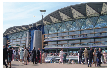
ABOVE: Race Day at Royal Ascot

The projects consisted of the design and installation of 3,000 panels of toughened glass for corporate boxes, internal stairs, balcony glazing, wall cladding and Brise Soleil. Deadlines for a race meeting 4 weeks before opening and Royal Ascot itself, which was attended by the Queen, were successfully met.